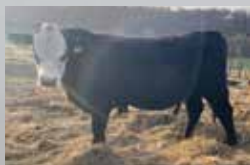
Lot 9 - L56 Bull