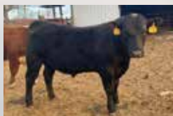
Lot 8 - L67 Bull