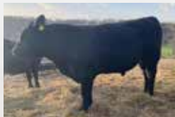
Lot 7 - L52 Bull