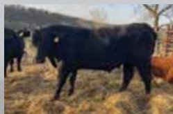
Lot 10 - L62 Bull